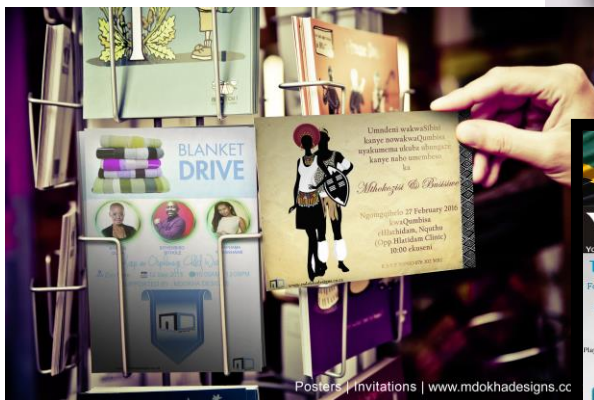
Posters | Invitations | www.mdokhadesigns.co