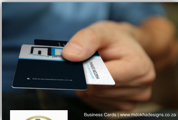
Business Cards | www.mdokhadesigns.co.za

From the above we will therefore quote you according to your required types of brands.